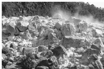
Sulphur Banks Trail